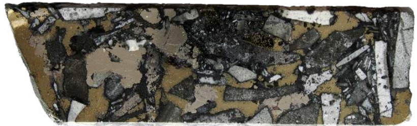
SDH17-034 376.7m: 1m @ 0.31 g/t Au, 124 g/t Ag, 6.92% Cu